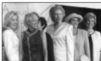
Star Award Honorees