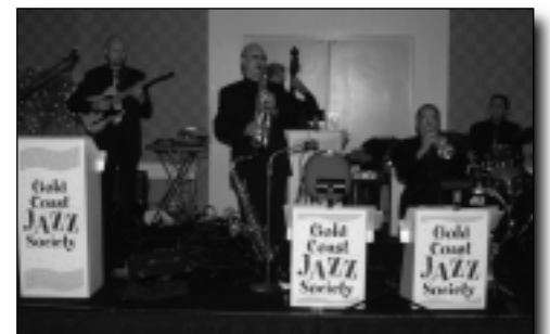
GCJS Band at PACE Jazz Club Fundraiser