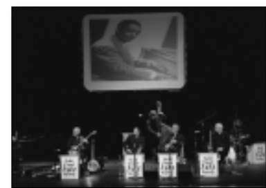
The Facets of Jazz

Middle school students learned about the history of jazz as the GCJS presented The Facets of Jazz in May. As a part of the Broward County Public Schools SEAS program (Student Enrichment in the Arts and Sciences) hundreds of Broward County public middle school students attended performances at the Amaturo Theater of the Broward Center for the Performing Arts. Members of the Gold Coast Jazz Society Band performed the multi-media musical program.