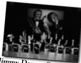
Jimmy Dorsey Orchestra