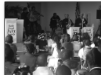
Martin Luther King Elementary