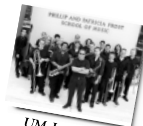
UM Jazz Band